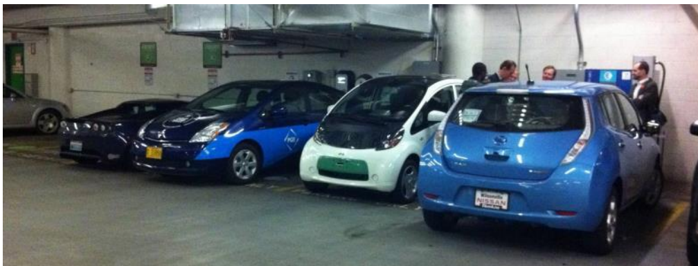
Four Charging Levels- L1, L2 6kW, Tesla 19kW, Leaf 50kW